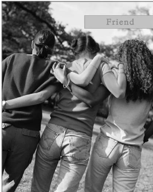
Friend ABUSE VICTIM

ADVERTISERS - Reach the whole state (over a million readers) with just one display ad placement for only $800! See your local participating newspaper or call Cheryl Ghrist at Colorado Press Service, 303-571-5117 ext. 24, for details.